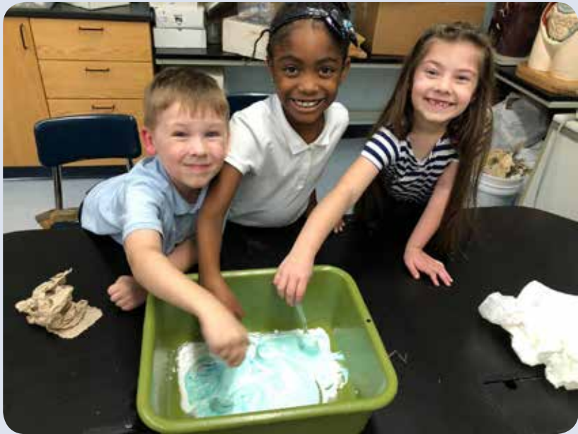
St. Michael School sixth, seventh and eighth graders interested in science, technology, engineering and math, have been working hard this year to plan many STEM activities for students in grades two through five. Our upper-class students are such great role models to our younger students.